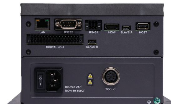
ATX-P1 Single Port Torque Controller