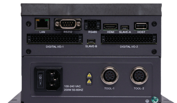
ATX-P2 Dual Port Torque Controller