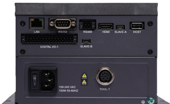
ATX-P1 Single Port Torque Controller